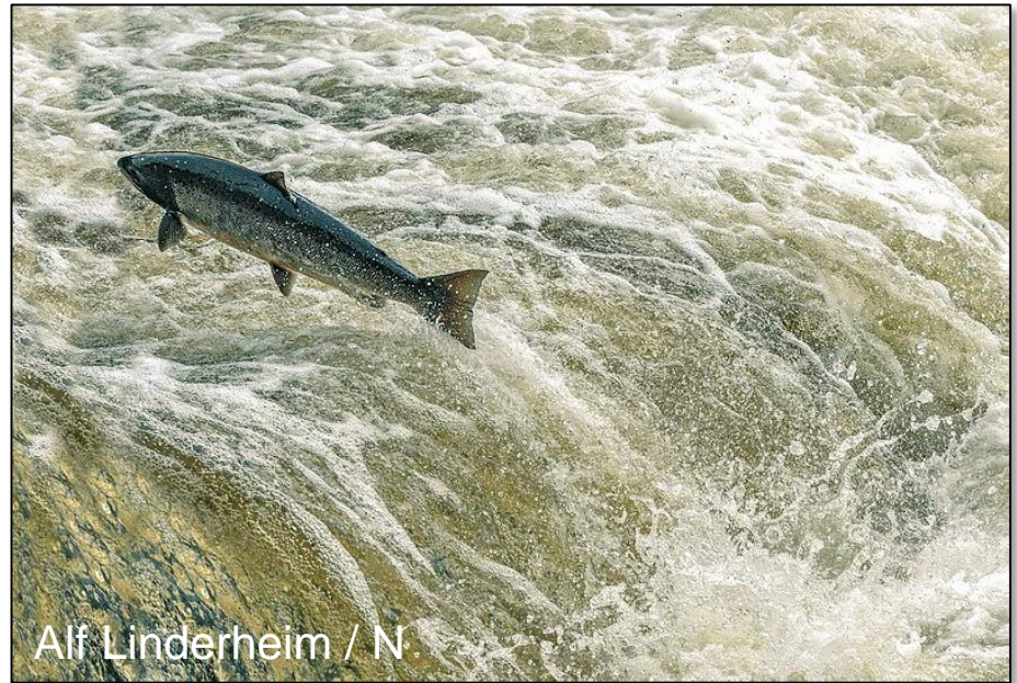
Alf Linderheim / N.